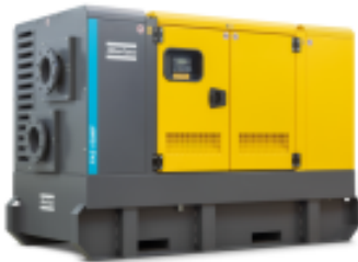
CNP PAS 150MF 250