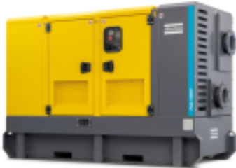
CNP PAS 150HF